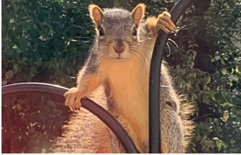
Photo Contest Winners Shine the Light on God's Natural Beauty