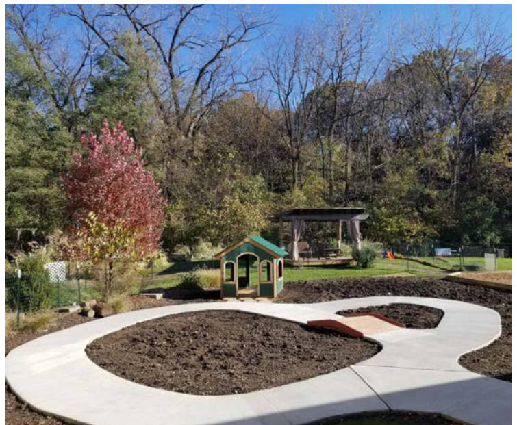
Greenview Plan for landscaping of the tricycle trail and sodding using a variety of flowering plants and shrubs.