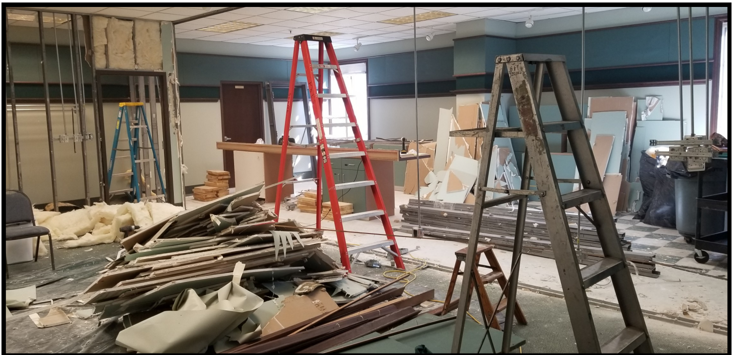
Work in progress on shared teaching space.